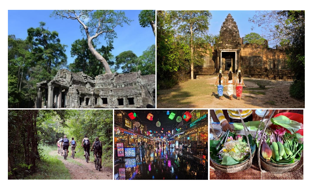
Day 3: Siem Reap

Accommodation: Treeline Urban Resort – Deluxe Urban View Room