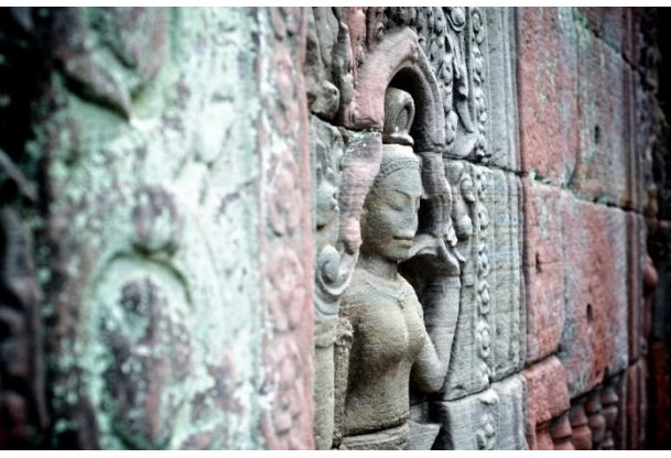
Day 2: Siem Reap